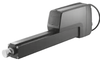
Thomson Electrak® HD Actuator Performance Testing Standards and Test Procedures v1.0